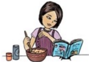
Cooking sessions and meal planning