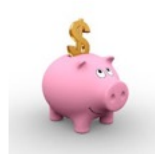
Budgeting your money