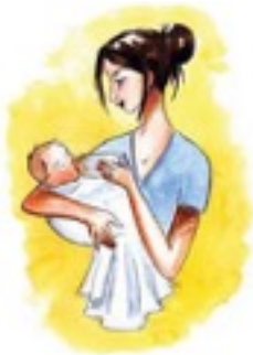
Feeding Your Baby