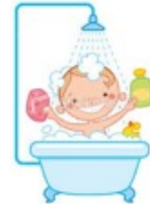
Bathing Your Baby