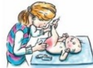
Changing Your Baby