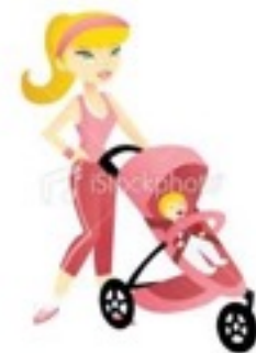
Taking Your Baby Out